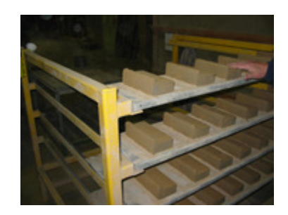
Brick Firing: Periodic Kiln; Tunnel Kiln

Stages of Firing: Water smoking, dehydration, oxidation, and vitrification. \sim 40 - 150 hours.