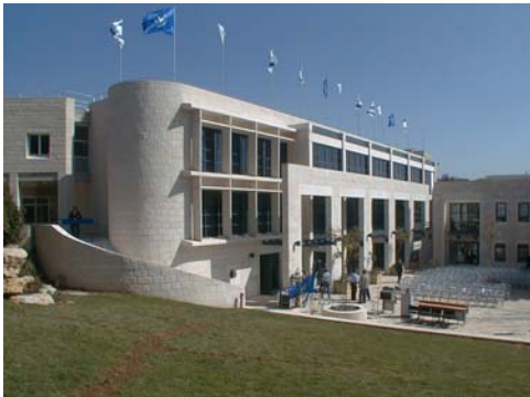
Cfar haNoar , Hebrew University Campus, Jerusalem, Israel Completed 2005