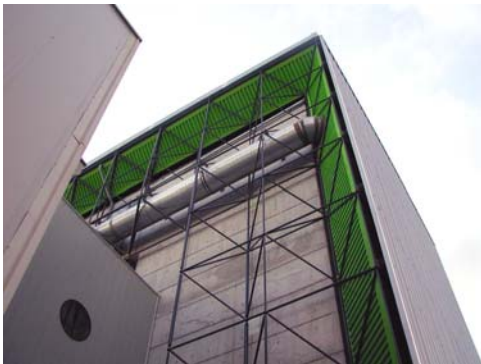
KBA Press Extension , HaAretz Press Facility, Tel Yitzhak, Israel Completed 2002

JK: Project Architect for Schocken Architects (all design, contract documents, and initial supervision)