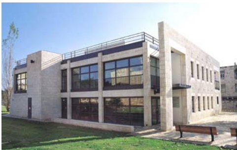
Meyerhoff Center , Hebrew University Campus, Jerusalem, Israel Completed 2000