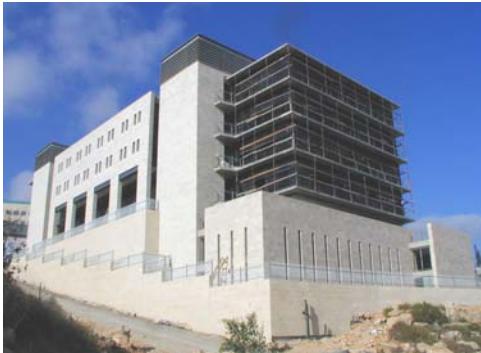
Minicom Company Headquarters , Har Hotzvim, Jerusalem, Israel Completed 2001

This building was custom-designed to include R&D, manufacturing, shipping/receiving, and management offices for the Minicom Company, makers of electronic video devices. The facilities include eating facilities and parking on three subterranean levels. Total area amounts to approximately 36,000 square feet of usable space and 40,000 square feet for parking.