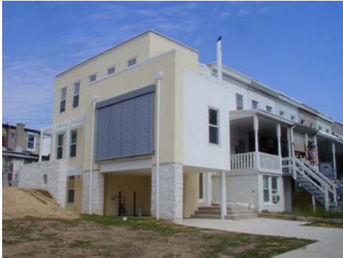
Residence at Lot 107 , 3418 Roland Avenue, Baltimore, Maryland Completed 2005

Designed for speculative re-sale, this house includes full living facilities, carport, three bedrooms, and three bathrooms in 1445 square feet. The bulk and massing of adjacent, traditional row-homes were maintained, but the materials are borrowed from contemporary commercial architecture: EIFS and split-face CMU.