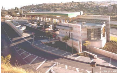
Alon Service Station , Kibbutz Ramat Rahel, Jerusalem, Israel Completed 2000

JK: Project Architect for Schocken Architects (all design, contract documents, and site supervision)