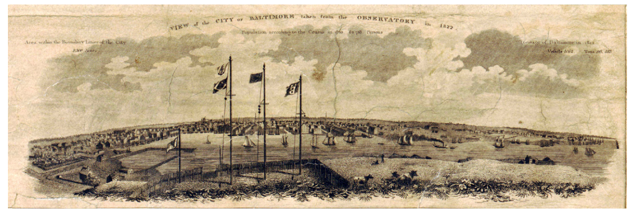
FIGURE 41: View of the City of Baltimore taken from the Observatory in 1822