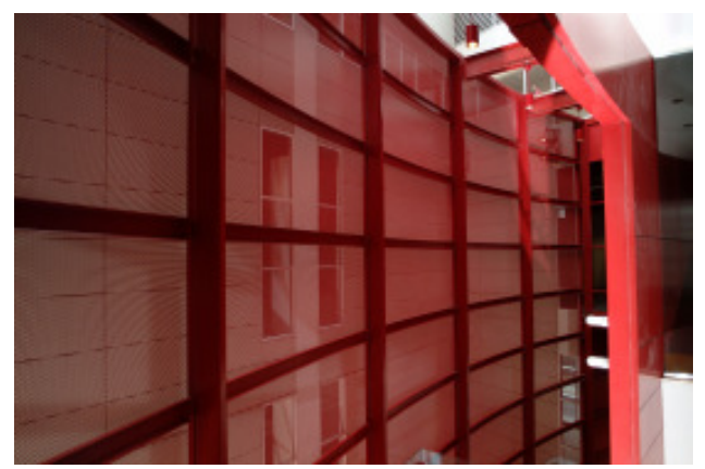
Reginald F. Lewis Museum, Staircase Screen Perceptual Framework: Reflection and Transmission

What, then, will visitors encounter when they come to Lewis Museum for Maryland African American History and Culture? Visitors will find History, no doubt, and they will find Culture -- however it might be packaged, presented, and put on display. The Lewis Museum is first of all a prime piece of intellectual real estate, the facilities for which are no more or less than state-of-the-art.