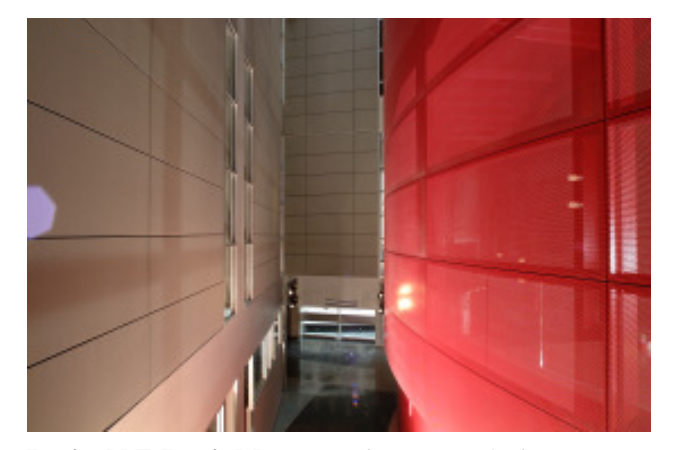
Reginald F. Lewis Museum, View across Atrium Gallery walls and Main Staircase: Generic and Unique.

The opening of the Lewis Museum for Maryland African American History and Culture occurs slightly behind the huge wave of the last decade of museum development. This lag may be partially responsible (together with the personal qualities of the museum's founders, developers, and architects) for the simultaneous discretion and high quality of its architecture. The Lewis Museum seems to embody "lessons learned" from other architectural experiments both here and abroad: