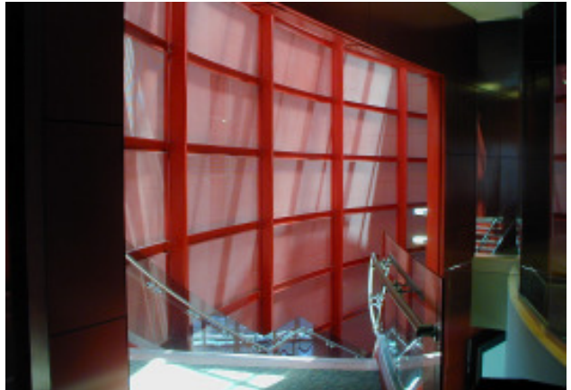
Reginald F. Lewis Museum, Stair and Screen Wall Perforated metal sheets allow transparency and catch the light.

might also be drawn with Pie Cobb Freed's more successful Holocaust Museum, the experience of which is almost entirely theatrical -- by curatorial intention. The Lewis Museum, on the other hand, has provided for its visitors an inspiring armature from which the material culture of African American history may be easily displayed.