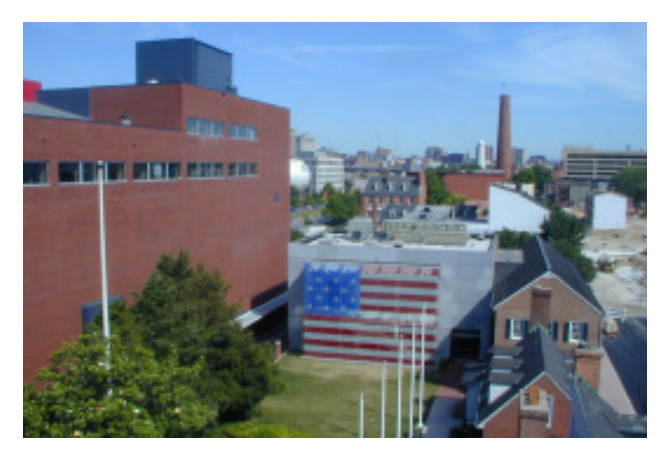
Reginald F. Lewis Museum, Flag House Garden The open space creates a central square among different museum themes.

features effect a large-scale, symbolic "gateway" for the reemerging Jonestown historic neighborhood behind the museum.