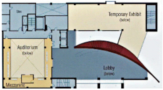
Second Floor: Orientation, Temporary Exhibits, and Auditorium

The temporary exhibit gallery is, on the other hand, separated functionally from this public space. The third floor is entirely given to the permanent collection. Like the other floors, these exhibit spaces form a ring of galleries around the central atrium; there is one additional room off the elevator core, to allow certain installations to be set off from the main line of visitors' traffic.