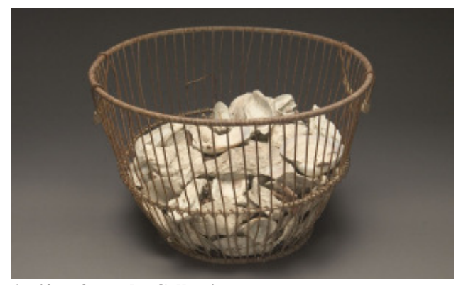
Artifact from the Collection Oyster Basket and Oyster Shells (20th Century)