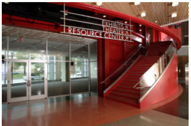
Reginald F. Lewis Museum, View from Entrance The stairs lead up to Exhibit spaces; the Gift Shop has its prime location.